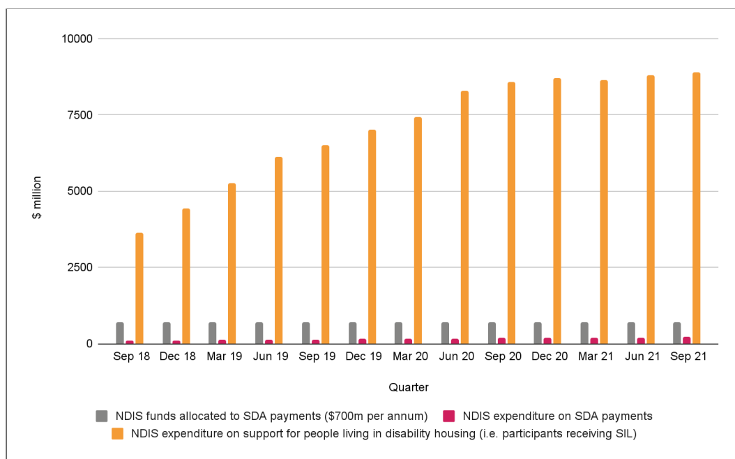
Figure 2. Current NDIS budget for SDA and expenditure on SDA payments & Supported Independent Living (SIL) costs

Hospital system: Timely access to NDIS funding will free up 1,100 hospital beds nationally in a hospital system under pressure during a pandemic.